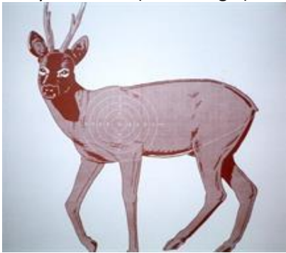
Rådyr stå 84 m (indre 4 og 5)