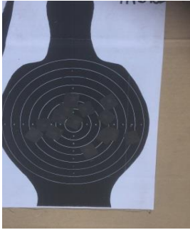
Tiur sitt 100 m (indre 7-10)