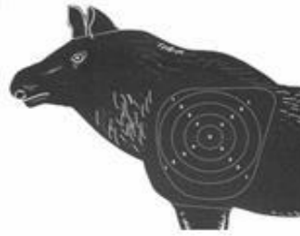
Elgkalv ligg 170 m (indre 4 og 5)