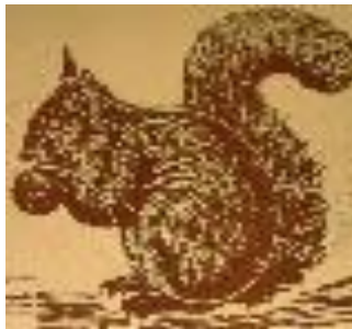
Ekorn sitt 52 m