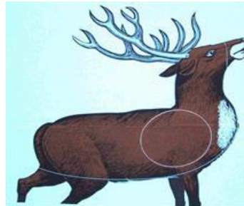
Hold 2 ligg 170 m