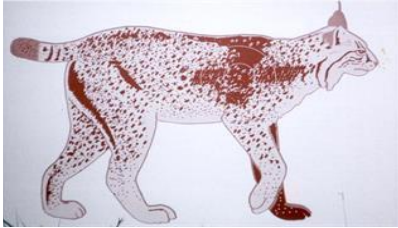
Hold 1 sitt 100 m