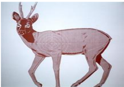
Hold 3 stå 84 m