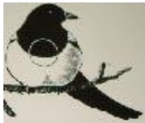
Hold 4 sitt 54 m