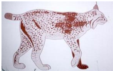
Hold 1 sitt 100 m