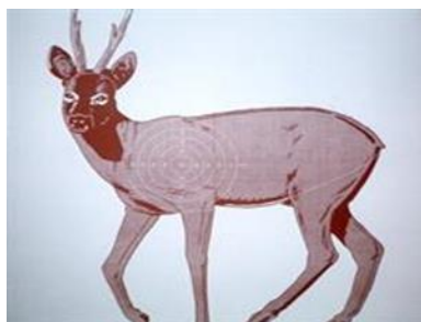
Hold 4 stå 84 m