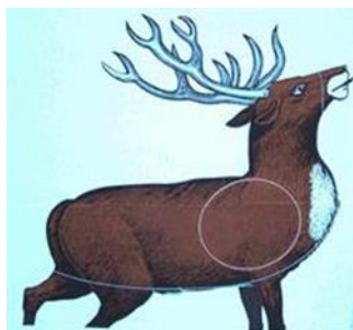
Hold 3 ligg 170 m