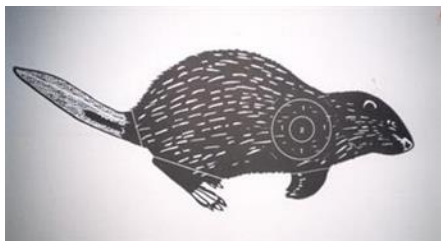
Hold 5 sitt 54 m