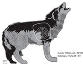
Hold 2 sitt 108 m